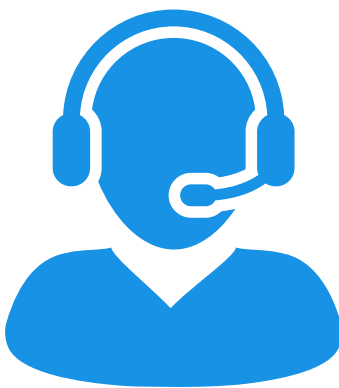
Air Traffic Controllers

Our designs regularly win international awards such as iF Design, IDEA, and Red Dot – but our most important achievements are the breakthroughs our customers achieve in their operations.